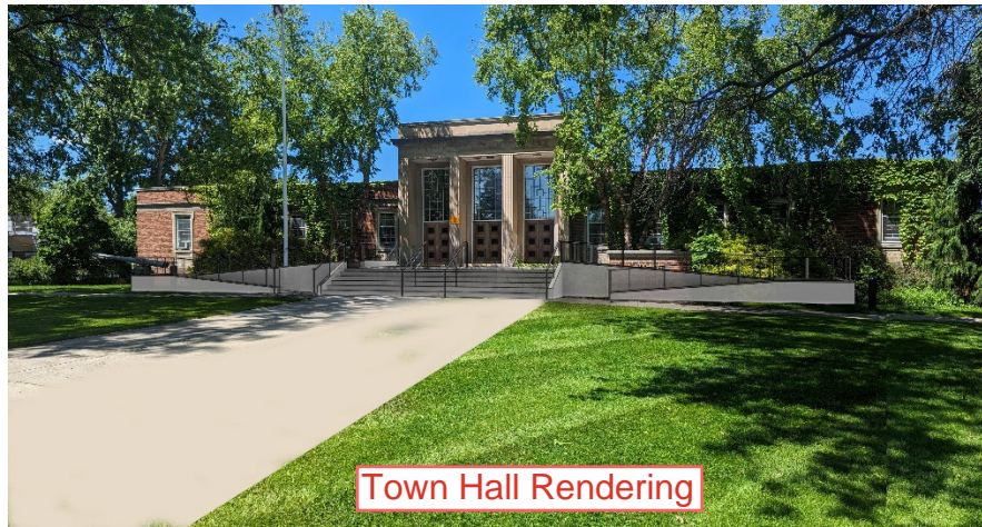
Town Hall Rendering