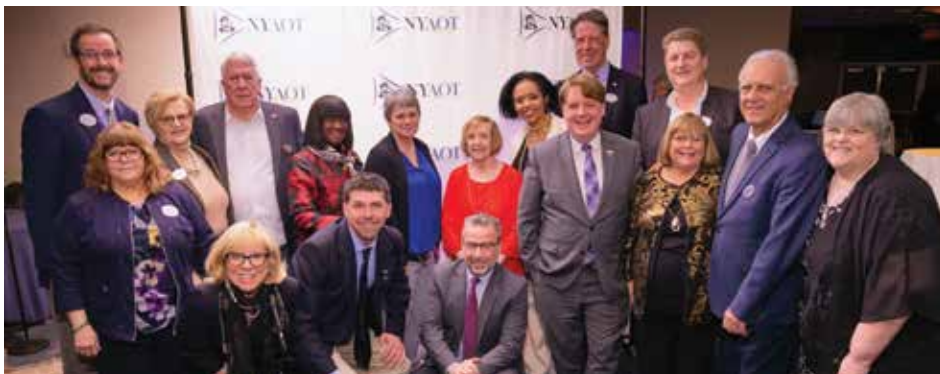
NY Association of Towns Annual Meeting

Re-imagining community promotes the idea of nullifying the narratives that feed fear, sow discord, stagnate and segregate. In this season where there is much uncertainty, re-imagining community perhaps begins with the commitment to build circles that will enhance the greater good. While no one community is monolithic, and differences will always be, the re-imagining of community is a purpose-led step toward receiving and receptiveness, traits that promote an openness to stronger human connections.